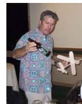
Never fly when drunk