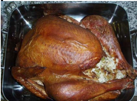
Last Thanksgiving Turkey Cooked by Art McCullough